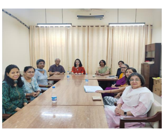
IQAC Meeting with external members