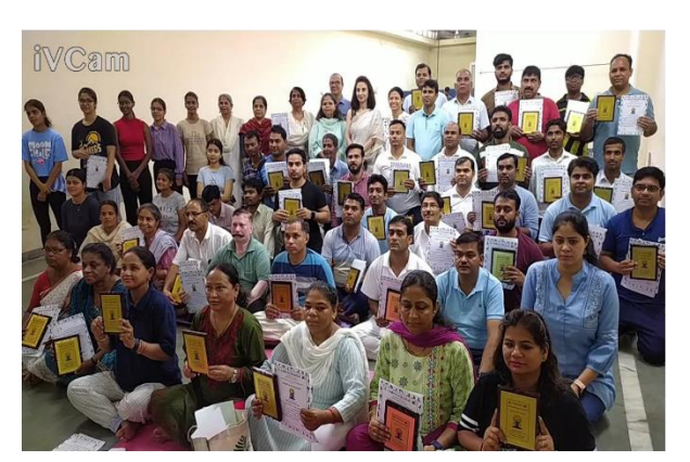
Five day Workshop for Non Academic Staff