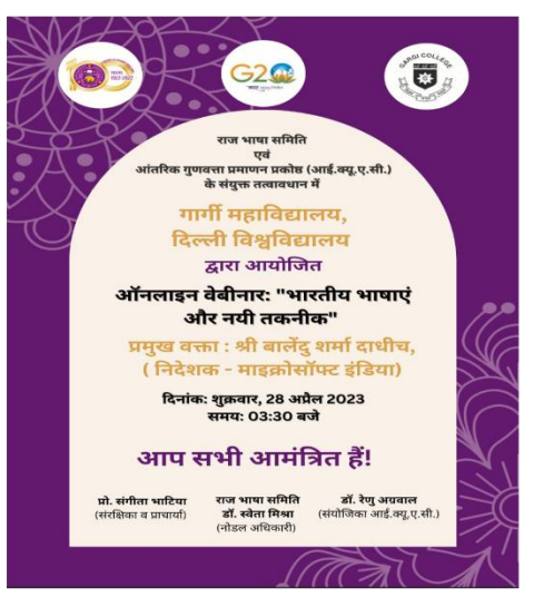
Bhartiya Bhashaye aur nayi takneek