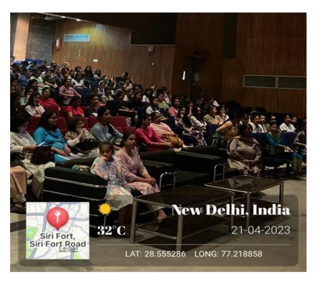
Exit Meeting with III year students